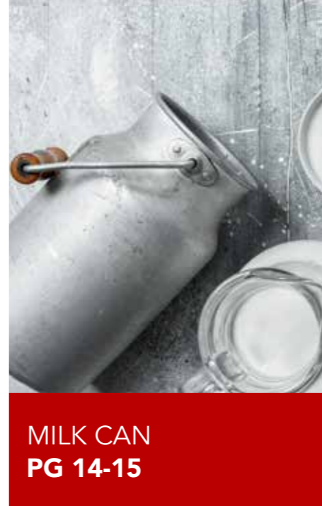
MILK CAN PG 14-15