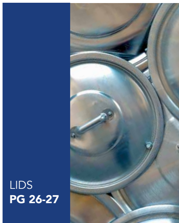
LIDS PG 26-27