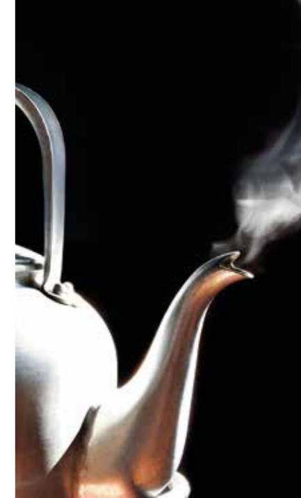
KETTLES PG 16-17