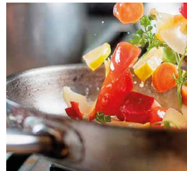
FRYING PAN PG 22-23