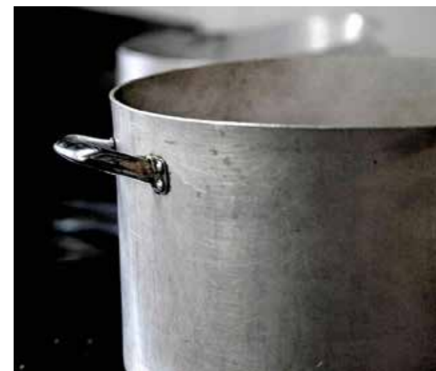
COMMUNITY COOKING POTS PG 28-29