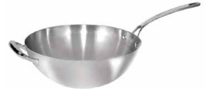
WOKS & COVERS