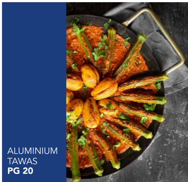
ALUMINIUM TAWAS PG 20