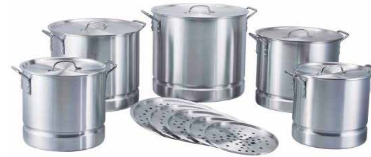
STOCK POTS Deep and shallow