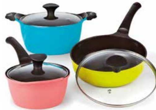
CERAMIC AND MARBLE COATED COOKWARE SETS