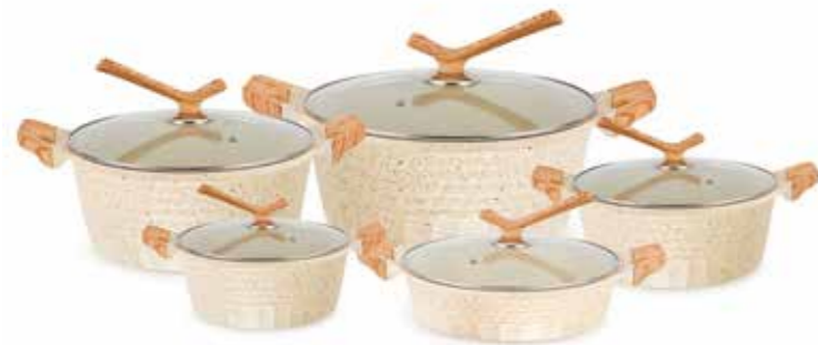
COOKWARE SETS WITH SILICON & GLASS LIDS