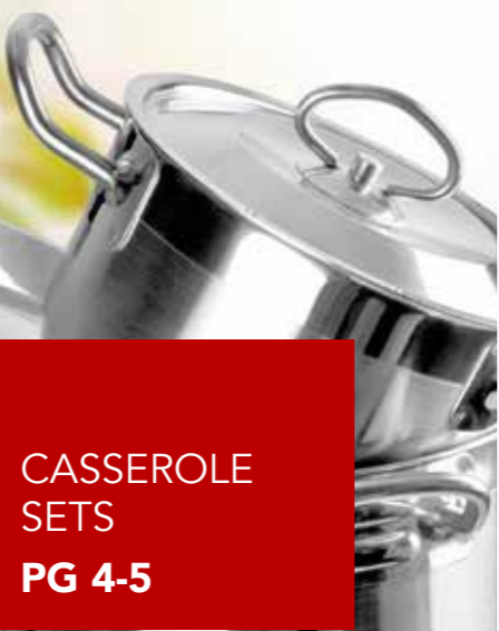
CASSEROLE SETS PG 4-5