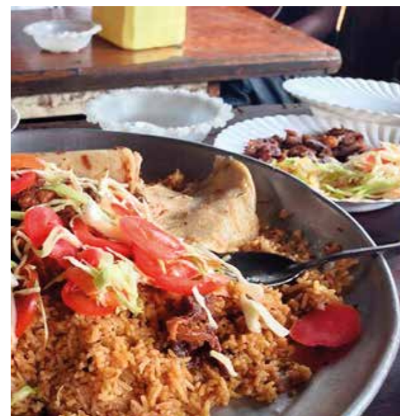
THALLA PG 21