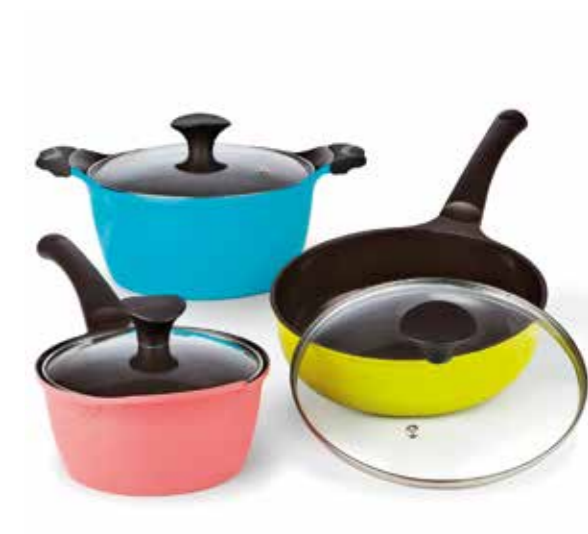
SPECIALITY PRODUCTS PG 30-31