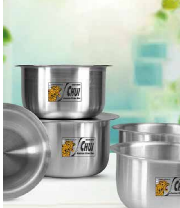
SUFURIA PG 6-13