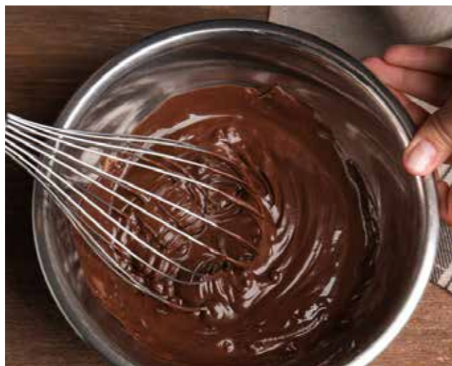
BOWLS PG 25