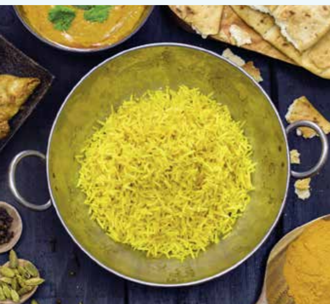
FRYING KARAI PG 18-19